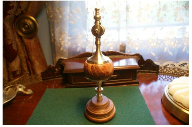
Faberge inspired 1.5lb Plumb Bob made out of solid brass, cocobolo, natural malachite cabochons & steel. Case is hard maple, ebony & brass decor. Everything is hand made & polished.

On EBay a seller offers his nice home made plumb bobs: Beautiful hand made Plumb Bob made with brass & rose wood burl, 15oz