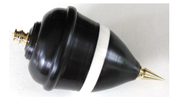
BILLARD BALL FROM IVORY