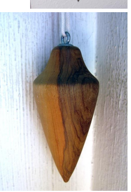
I am attaching a photo of a curtain cord weight which I turned out of olive tree wood in the shape of a plumb bob. EZ