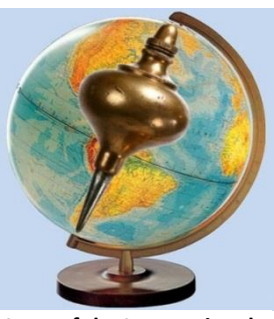
Logo of the International Plumb Bob Collectors Association IPBCA

Amt Sinfterwalbe, ben 18ten Upril 1823. Ronigi. Dreuß. Jufti . Amt.