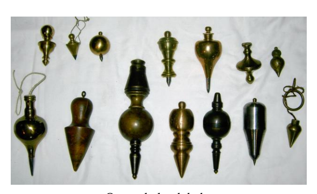
Ornated plumb bobs