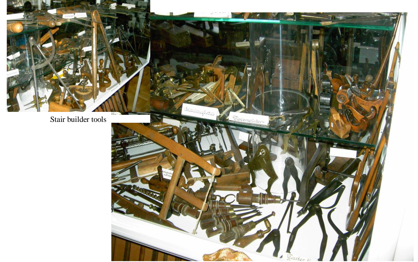
Coach-, violin- und instrument builder tools