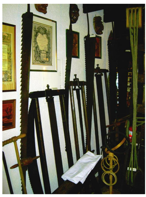
Very long, these two men pit saws (up to 8 feet)