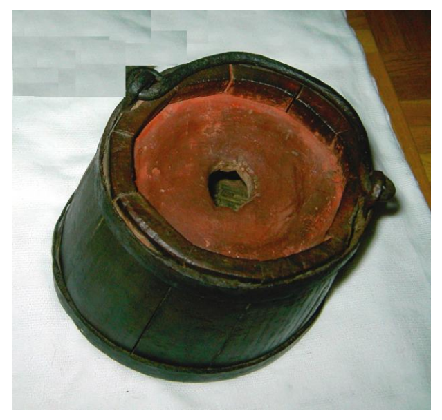
Pot with a red color (Rötel). In Austria the chalk line is also called "Rötelschnur"

There are also chalk lines from all over the world in the collection. (more see in WOLF'S PLUMB BOB NEWS 2008-11 "History of the chalk lines")