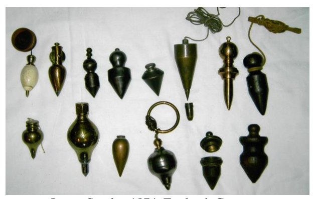
Ivory, Stanley 1874, England, Germany