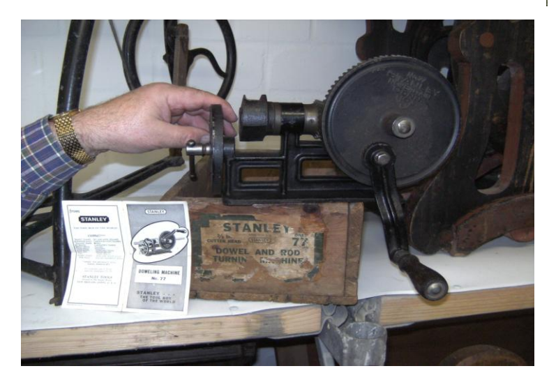
Also more woodworking machines. This is the #77 "dowel and rod turning machine" from Stanley Rule & Level Co (produced 1911 to 1969). More see www.woodmagazine.com