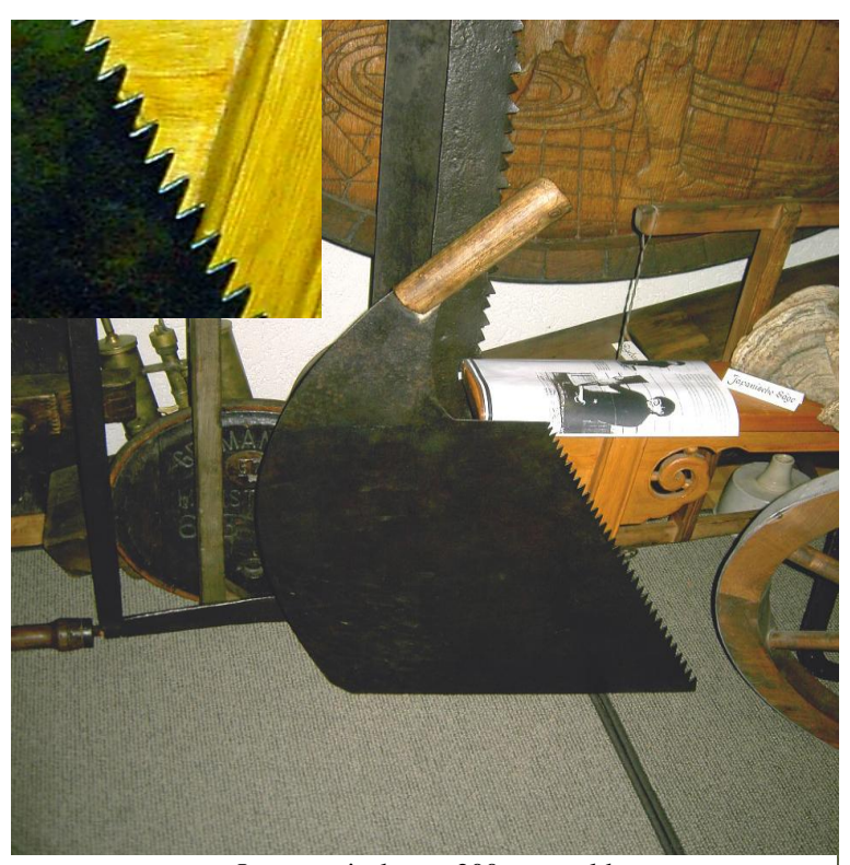
Japanese jack saw 200 years old