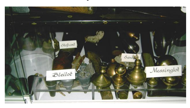
Lead and brass bobs