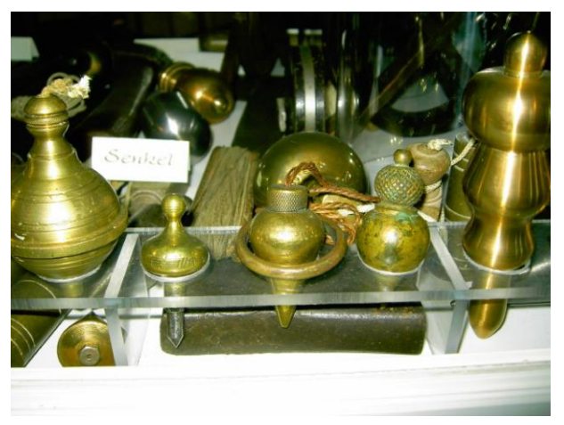
Plumb bobs from Portugal and England