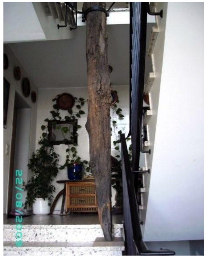
Original tree of the first Roman Bridge, built in 310 AD Used for the foundation.