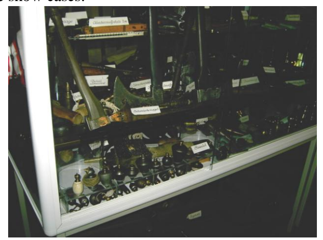
Plumb bobs of different material