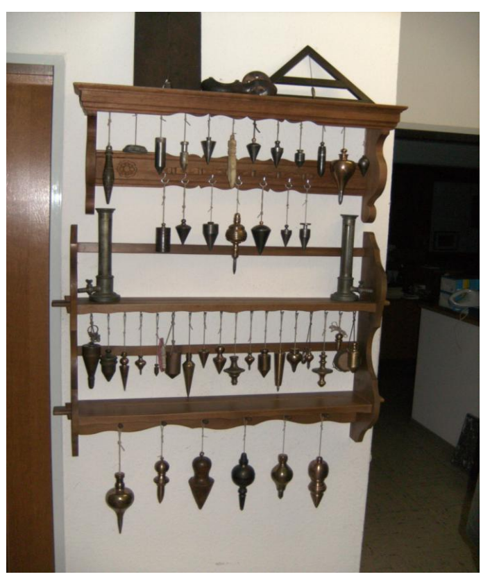
In the middle: Water level