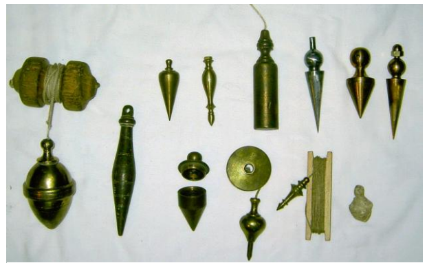
Portugal, Ottoman, Netherlands, England etc.