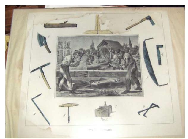
Hundreds of pictures and drawings of old tools