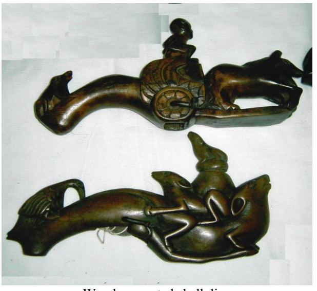
Wooden ornated chalk line