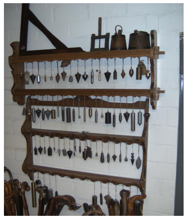
Plumb level, chalk line, plumb bobs and walking-sticks

That box of plumb bobs from the "basement" emerged after my first visit, to hang under this old wooden cupboard, their sojourn in the dark boxes in the basement now over for these plumb bobs. ©