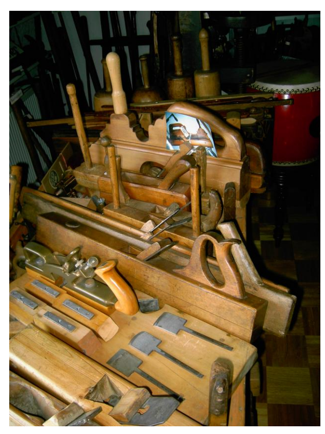
Planes, planes, planes, each more beautiful than the next!