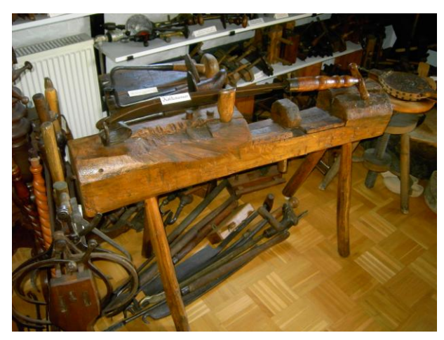
To make wooden shoes (clogs)