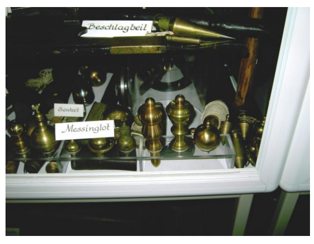
Brass plumb bobs