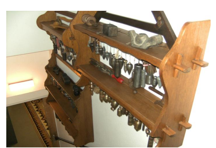
Old wooden cup boards to display plumb bobs