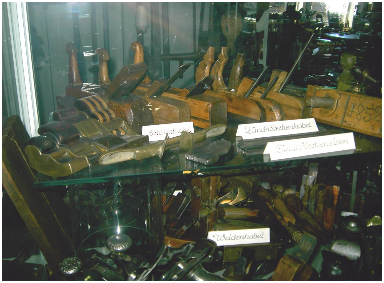
Willow/wicker planes for basket plaiter, match planes etc.