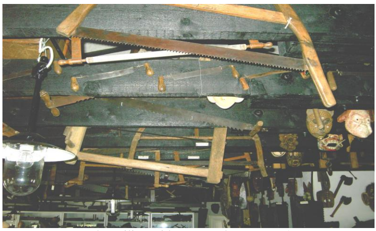
The ceiling with more and more saws!