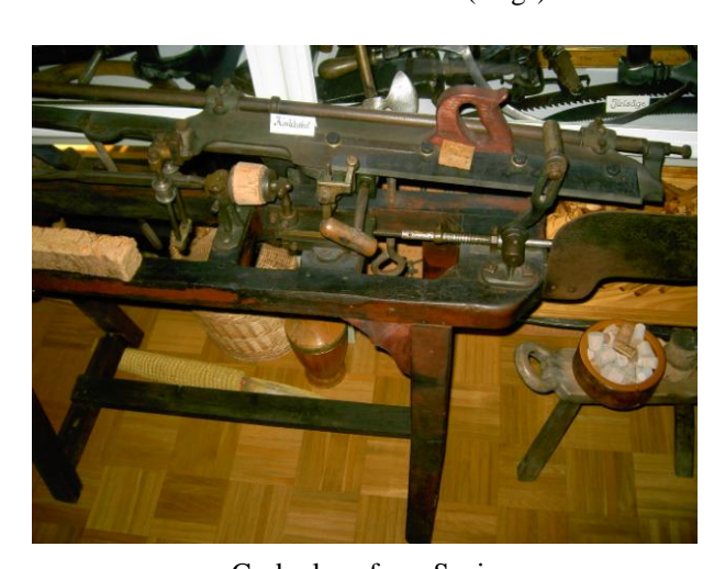
Cork plane from Spain - 159 -WOLF'S PLUMB BOB NEWS 2009-09 VISIT PLANE MUSEUM SCHMITZ