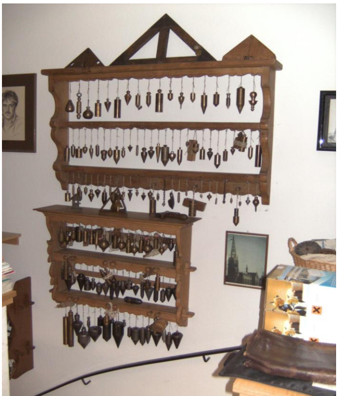
Stairway to the basement