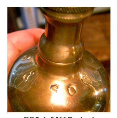
WIG & SON England