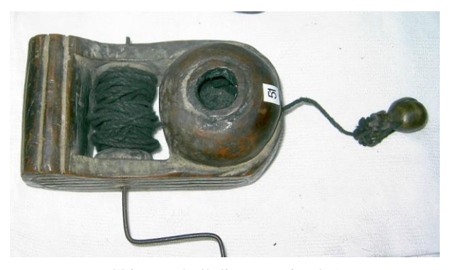
Chinese chalk line (sumitsubo)