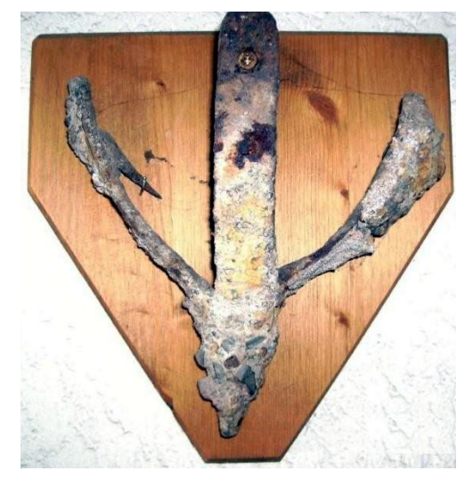
Reinforcement iron of the tip