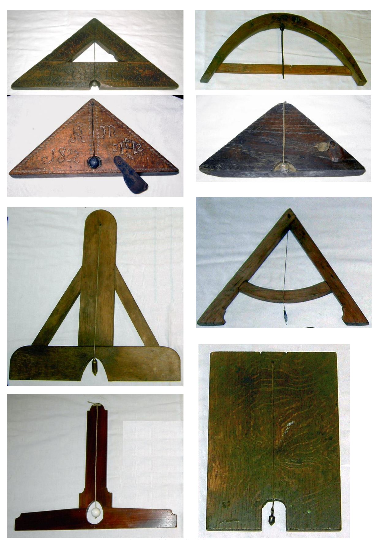
Wooden plumb levels indifferent shapes.

Some plumb levels (grandparents of the levels with vials). More see "WOLF'S PLUMB BOB News 2009-01 plumb levels". These plumb levels with (plumb bob / weight) were used up to 1930 in Germany.