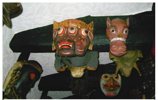
Hundreds of masks from all over the world