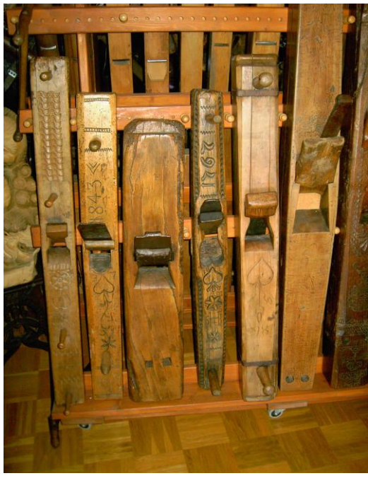
Do you have a tool box for these big planes? 2 men planes (4 ½ feet).for planks / floor and planes for coopers

Plumb levels and plumb bobs are a very small part of the shown items in this museum. The focus is on the woodworking tools from nearly 60 professions. This short newsletter unfortunately can't show them all. These pictures below are but a sampling of this vast collection.