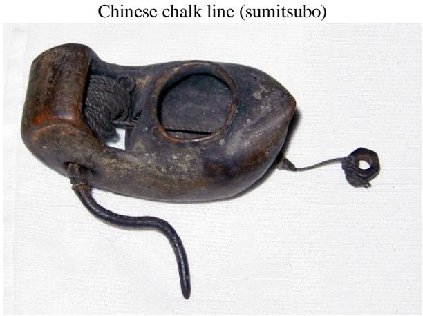
Chinese chalk line (sumitsubo)