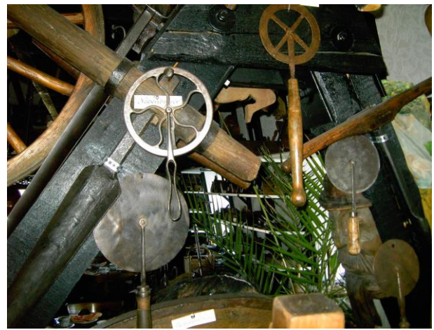
Wheel hub drill and measuring tools for wheelwrights