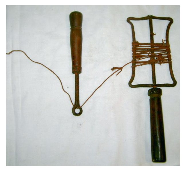
Line, spool and holder. The holder very often is missing, because nobody knows for what this handle with the ring was used.