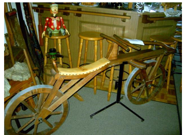
Reproduction of a wooden "running machine" from Karl Drais. (1817). Basic for the later bicycle. More see: <a href="http://en.wikipedia.org/wiki/Karl_Drais">http://en.wikipedia.org/wiki/Karl_Drais</a>